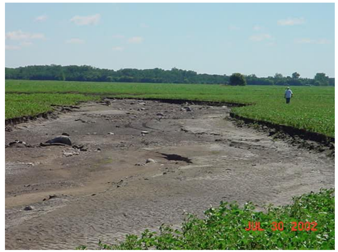
2002 Flooding showing downstream damages in Hazelton Township, Kittson County from crossover flooding and breakouts on Middle Branch Two Rivers